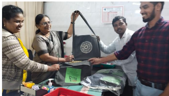
Seen here, terracotta jewellery made by the children, and the completion of first order of 50 stencil-painted bags for the DCPO