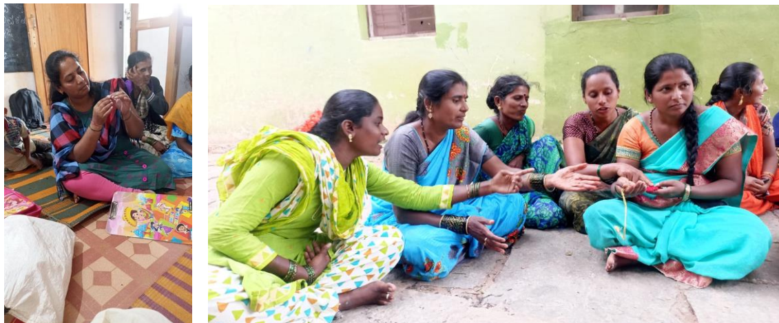
Seen here, women undergoing training in silk thread jewellery making.

Secondary Internship Training: Headstreams has undertaken the task of orienting 1200 women to entrepreneurship in Kolar District this year. Done as a one-day workshop, the women assess the resources they already have, learn the basics of one handcrafting skill, and are introduced to how the market value of a creation using this skill can be increased so profit margin increases. As of November 30, 2022, 265 women have attended the full-day training.