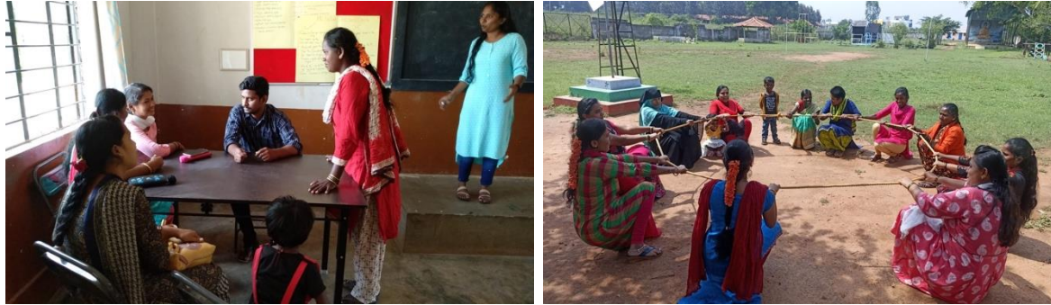
Seen here, Spoorthis undergoing training in facilitation of SHG sessions.

sheet, production sheet, monitor SHG and internship attendance and fill in the income and expenses sheet. Spoorthis have also supervised the internship sessions of entrepreneurship and financial literacy. Spoorthis are given a monthly honorarium by the SHG they lead, as a token of appreciation for the work they do.