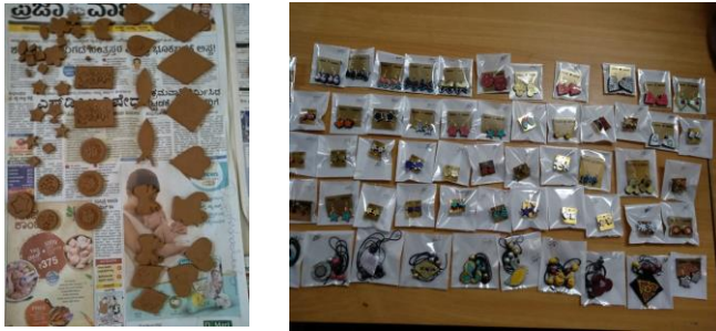
Seen here, terracotta jewellery made by the children

conducted for girls at SPARSHA and APSA in Bengaluru and the Government Homes for Girls in Mysore, Madikeri and KGF.