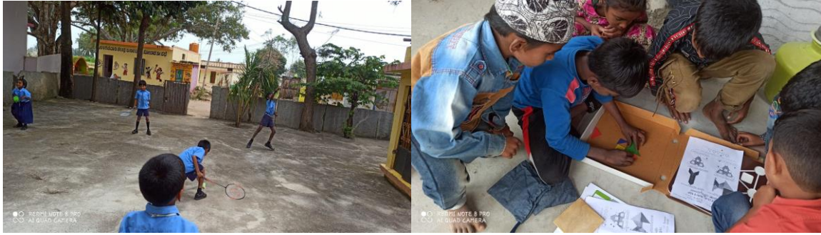
Seen here, children playing outdoor and indoor games