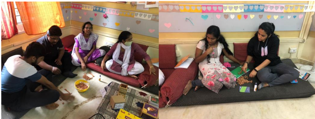
Seen here, students involved in an activity during the orientation.

Every year, Headstreams trains college students to become play facilitators through a one-year academic course called Play and Human Development. This year we have 12 students from Christ (Deemed-To-Be) University, 7 students from Mount Carmel College and 1 student from St. Joseph's University doing the course. The first orientation workshops were held in the Headstreams office on September 24 th and October 15 th . The students learn the theory of the course on Moodle and facilitate play spaces for underprivileged children on Saturday afternoons, as part of their practical work.