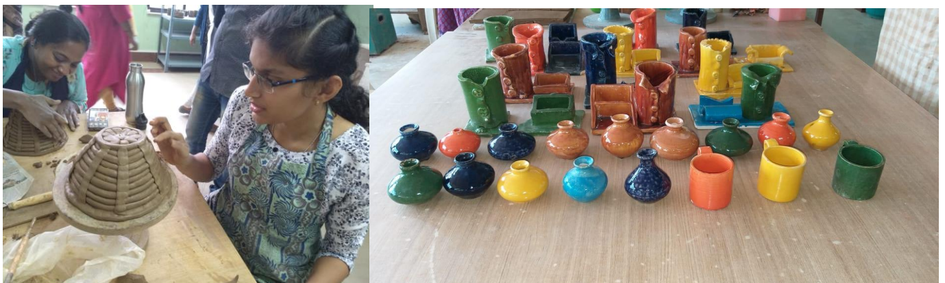
Seen here, an intern crafting a planter, and products made by the interns during the SAMARTH training on pottery skills

In addition to this, the Headstreams team has helped them open bank accounts, and procure Aadhaar Cards. To ensure holistic development and learn leadership skills, the interns help facilitate the Play and Learn sessions at our HSR project site every Saturday.