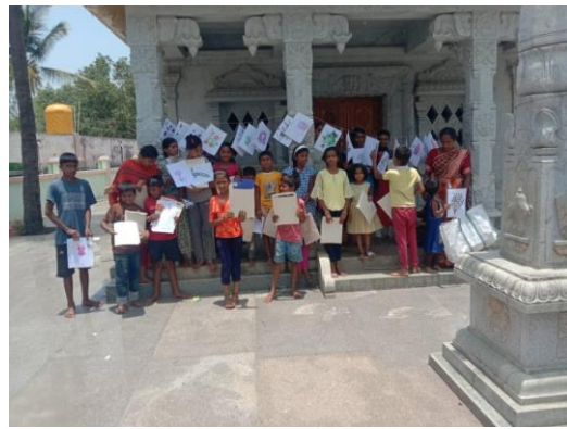
Seen here, a OLC training introducing the Maths Kit and children exhibiting their art work at a Let's Play event