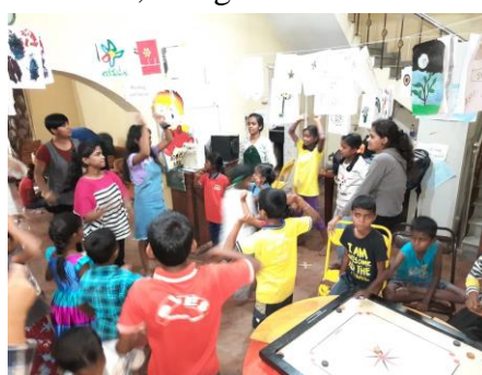
Seen here, an art and craft session in progress, and children gathering for an action song